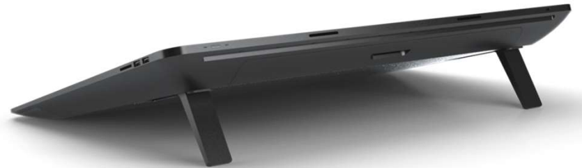
Wacom Cintiq Pro

*Some VR headset systems may require additional equipment, including a USB-C to USB3.0 hub and HDMI to mini-HDMI adapter, when connected to the Wacom Cintiq Pro Engine.